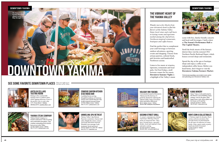
Travel Guide - Eighth Page Co-op Section Featured Listings